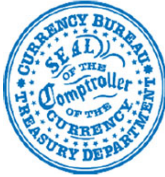
Acting Comptroller of the Currency